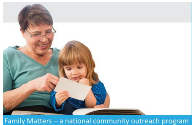
Family Matters – a national community outreach program

Legacy 9.0 Family Tree Setting a New Standard in Genealogy Software