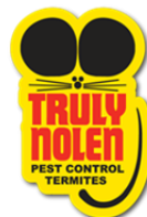
Family Matters – a national community outreach pro